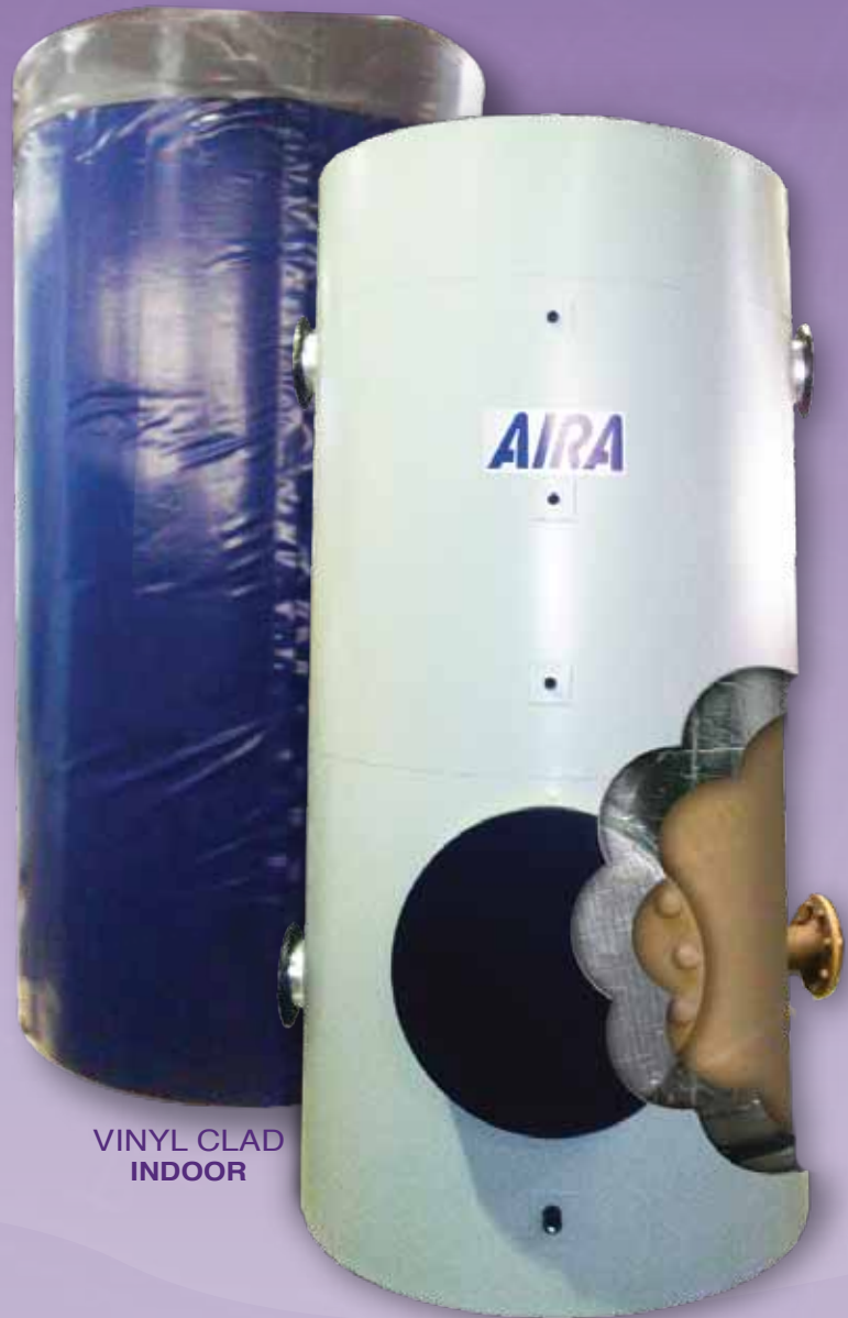
VINYL CLAD INDOOR